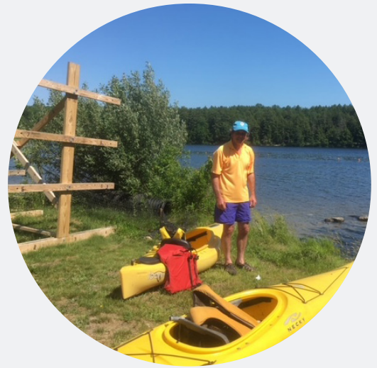
Kayak/Canoe rack at the Readfield Beach