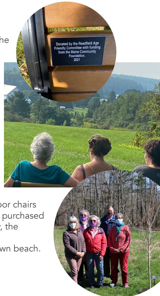
Bench purchased for the trail system