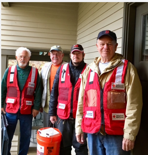
Handy Helpers Sand Bucket Program