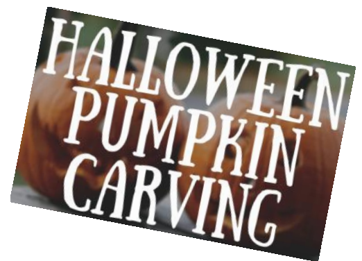
Picture from a previous RUMH Pumpkins Aglow