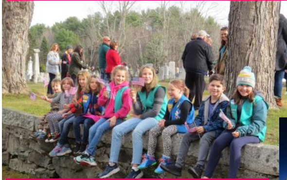
Girl Scout Troop #2098 and friends waiting for the event to begin.