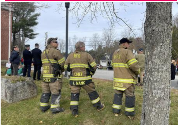
The Ceremony at Gile Hall. Three members of the Readfield Fire Department, with some of the American Legion Post # 40 in the distance.