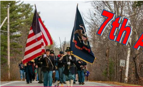
The 3rd Maine led the procession down Church Road to Gile Hall.