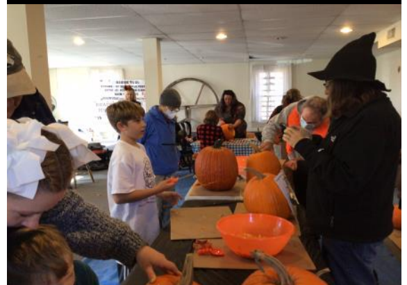
Pumpkin carving inside the Vestry for Pumpkins-A-Glow