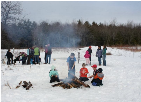
Winter Family Fun Day, Curtis Homestead Conservation Area