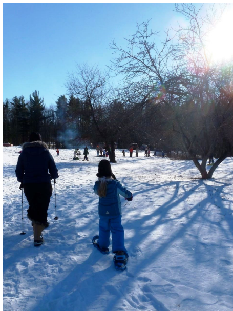
Winter Family Fun Day, Curtis Homestead Conservation Area