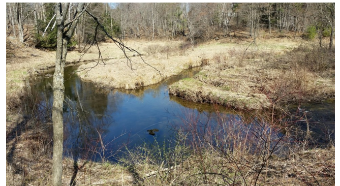
View of old mill pond from top of dam structure.

The Mill Stream Dam was breached by floodwaters in the late 1980's. The proposed restoration plans will not fix the breach, but will stabilize the existing structure and allow people to walk on and around this historic structure.