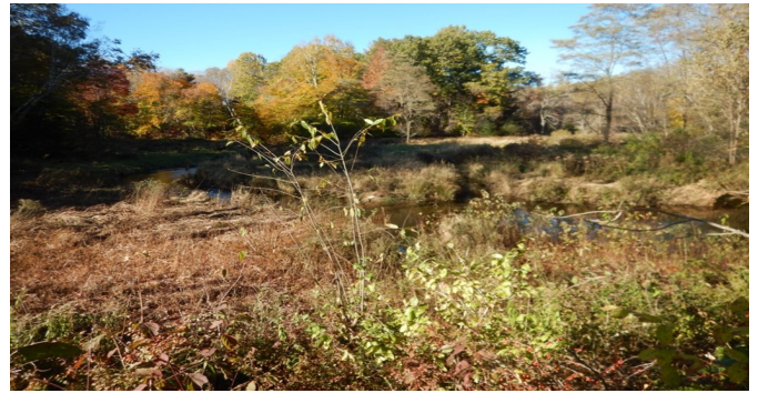
The Mill Pond